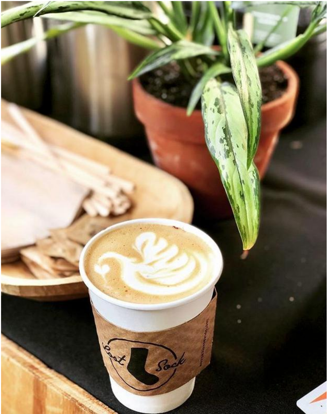
Lost Sock Roasters, a small-batch coffee roaster based in D.C.'s Brightwood Park, gets retail space in the Takoma Theatre.

In addition to its brewed coffee drinks, it will also sell food from the popular Call Your Mother in Petworth, where its coffees are featured.