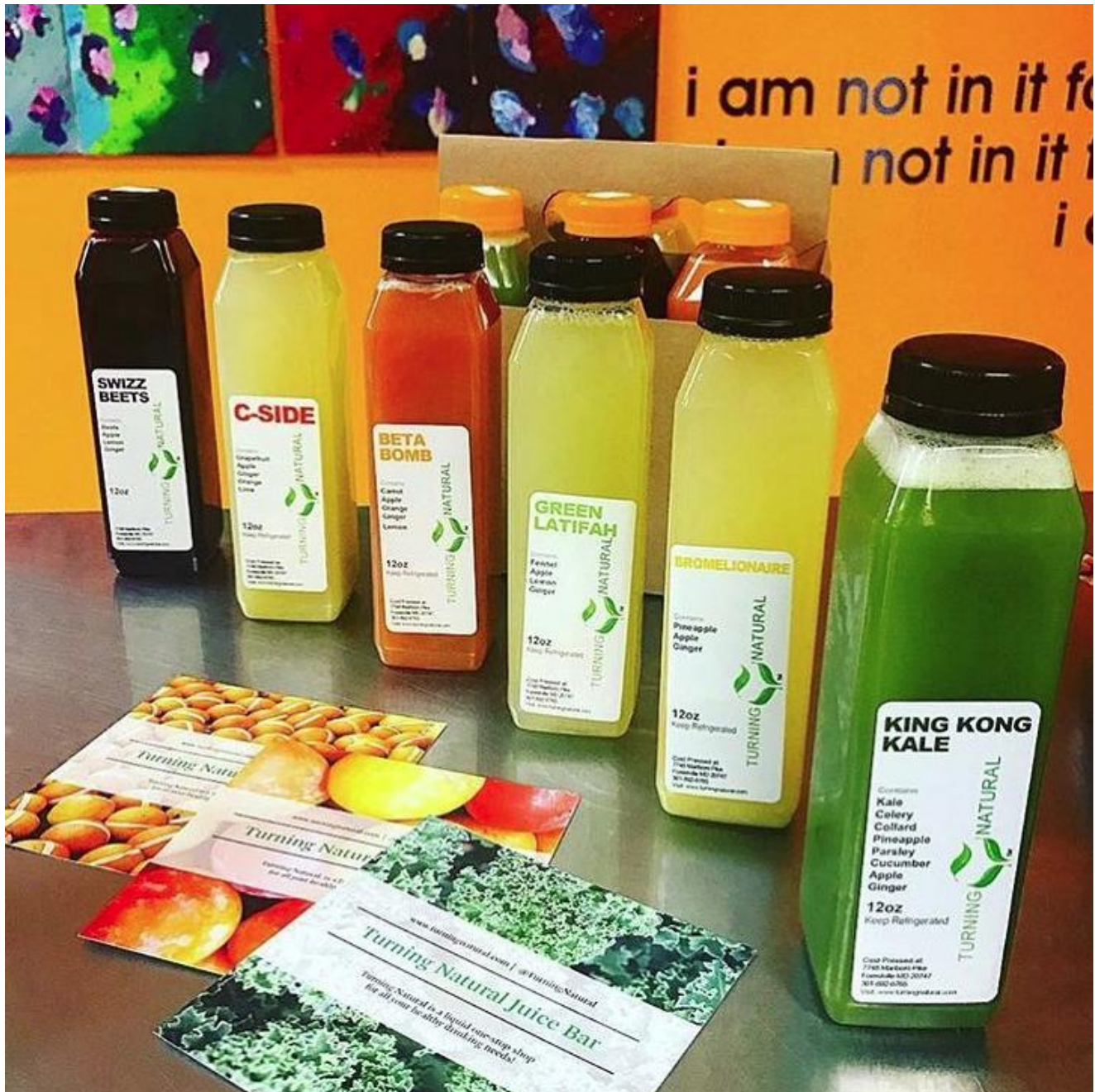
Turning Natural, a juice bar and cafe, will open its sixth D.C.-area store at Takoma Theatre. (Courtesy Turning Natural) WTOP/Jeff Clabaugh