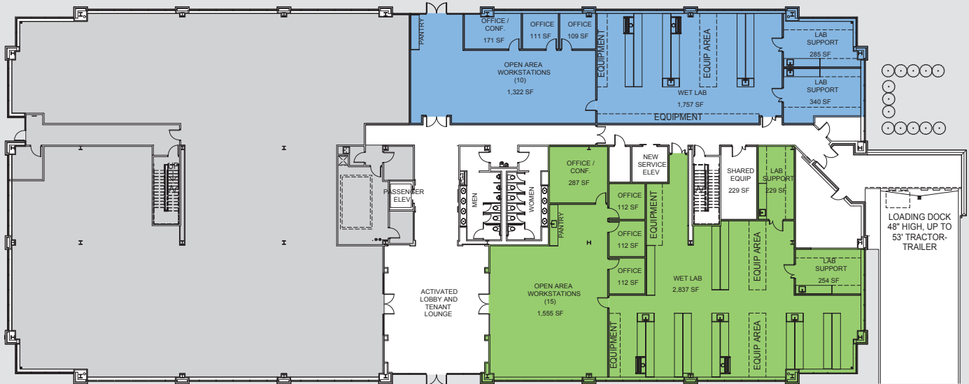
20440 Century Boulevard | First Floor