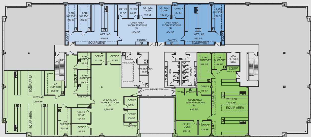
20440 Century Boulevard | Second Floor